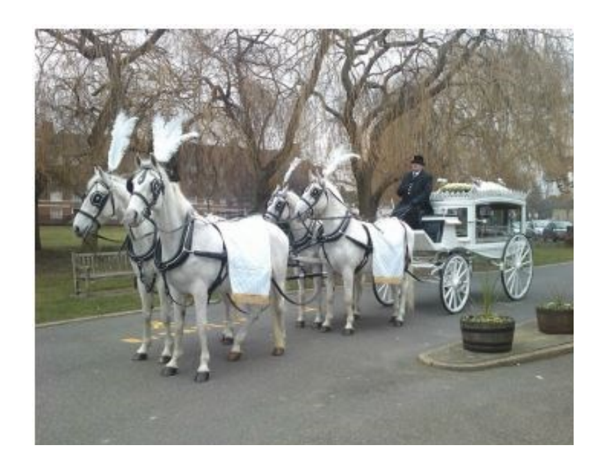
Horse-Drawn Hearse with 2 pairs of White Horses and a white Hearse. Additional charge from: £2155