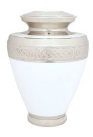
with Brass "Marble White" Urn £295