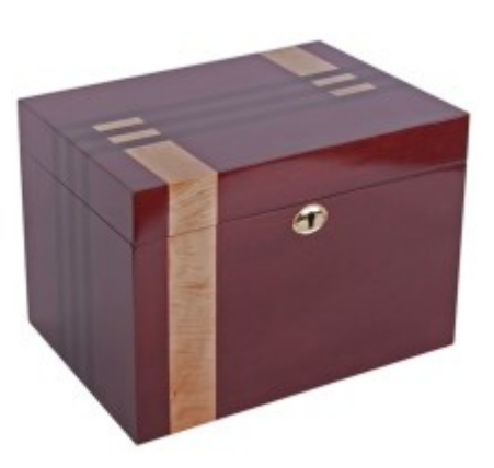
with Inlaid Wooden "Azure" Casket £285