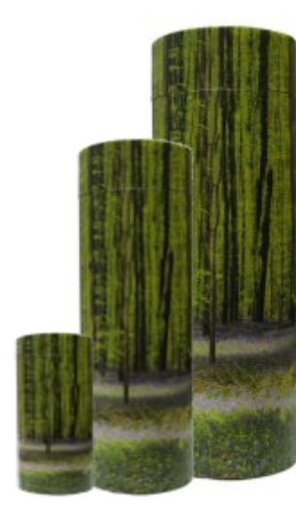
with Bluebell Scattering Tube All sizes 1 - £95 (2 - £125) (3 - £150)