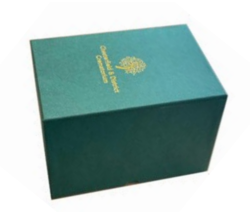
with Crematorium Box £65