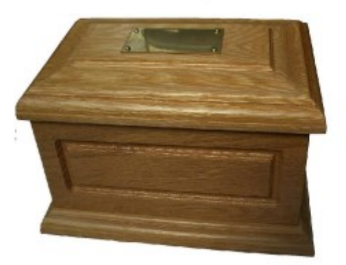
with Solid Oak Casket £215