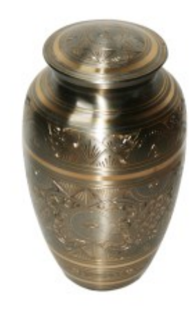
with "Sovereign" urn £290