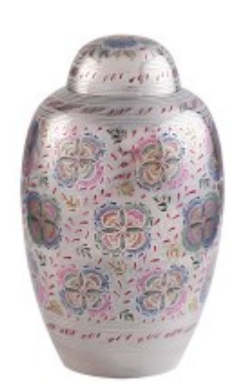
with "Grace" Urn £295