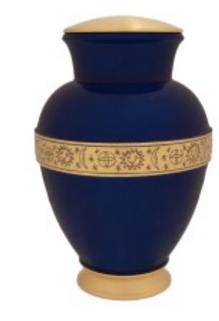
with Blue Harvest, Metal Urn