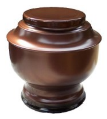
with Metal Spun Urn £185