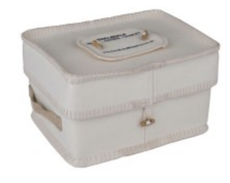
with White Woollen Urn £245