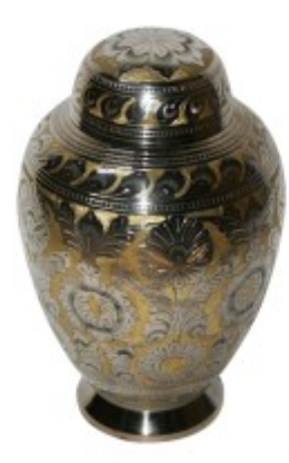
with Ambassador Urn £305