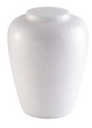
with "Simply Marble" Urn £295