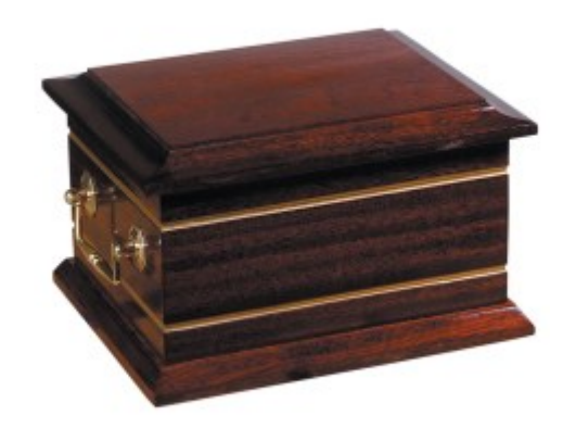
with Solid Wood "Lesbury" Urn £295

Our Prices Include for the Collection/Receiving of the Ashes, for taking responsibility for them and for storage on our premises for up to thirty days Subject to availability