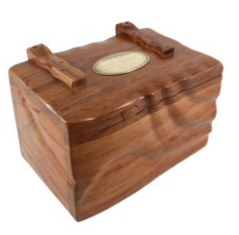
with Solid Wood "Trent" Urn £295