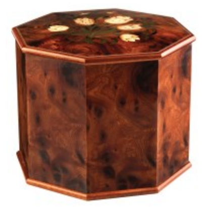
with Florence Urn £665