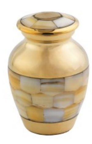
with Mosaic Urn £295