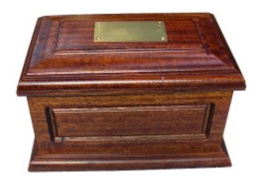
with Solid Mahogany Casket £215