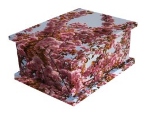
with Spring Blossom Casket £295