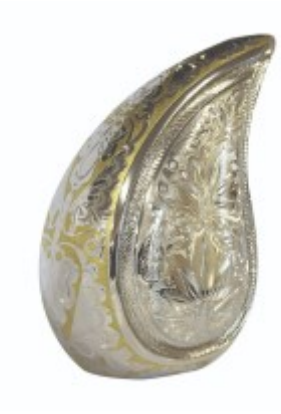
with Teardrop Patterned Urn £385 Inc. Keepsake - £475