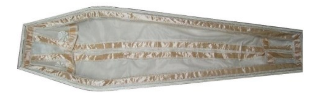
A Coffin Interior