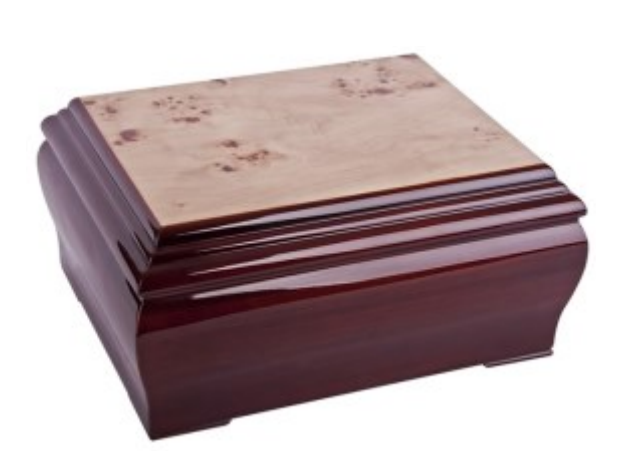
with Continental Casket £255