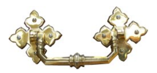
Set of Antique, Solid Brass Gothic Handles