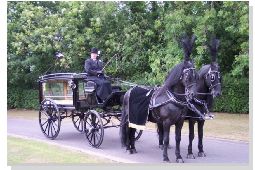
Horse-Drawn Hearse with a pair of Black Horses and black Hearse. Additional charge from: £1495.00