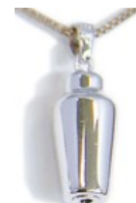
with Mini Urn Pendant (no chain) £265:00