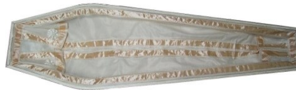
A Coffin Interior