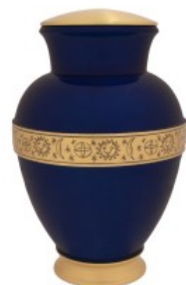
with Blue Harvest, Metal Urn £335:00