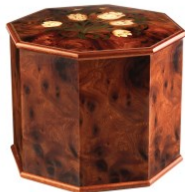
with Florence Urn £585:00