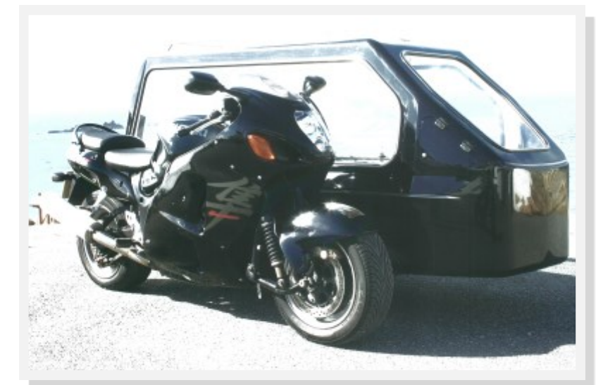
Motorcycle Hearse. Additional charge from: £1355.00