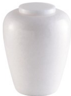
with “Simply Marble” Urn £275:00