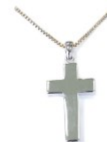
with Cross (with chain) £265:00