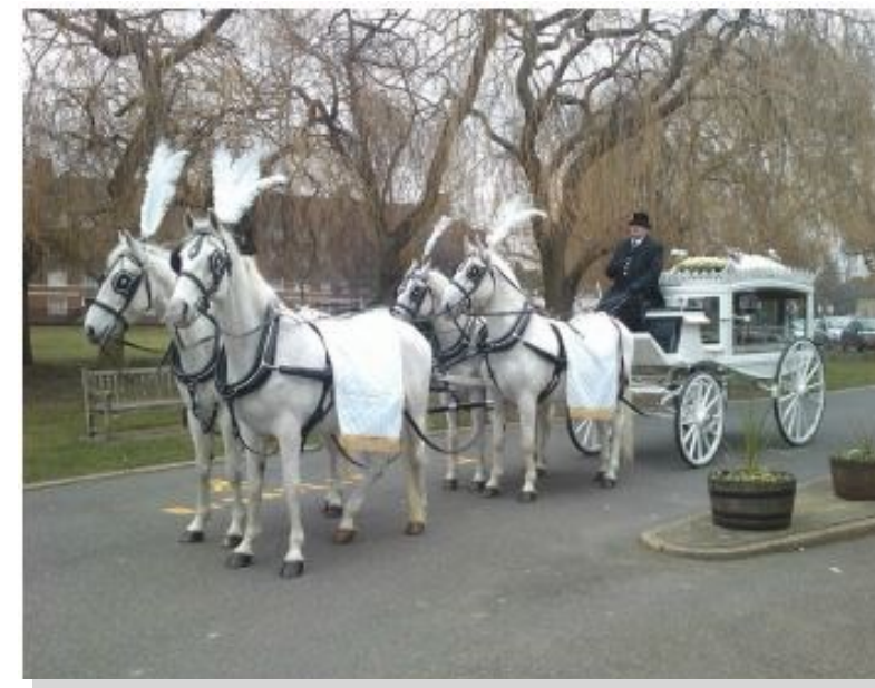
Horse-Drawn Hearse with 2 pairs of White Horses and a white Hearse. Additional charge from: £2155.00