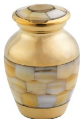
with Mosaic Urn £285:00