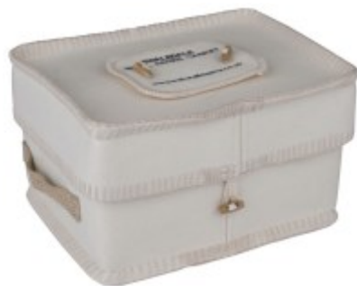
with White Woollen Urn £225:00