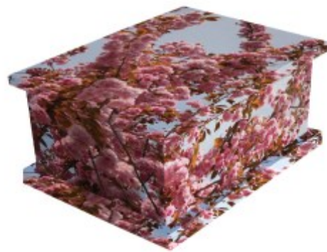
with Spring Blossom Casket £295:00