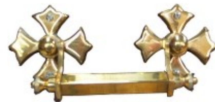
Set of Solid Brass Handles.£245:00