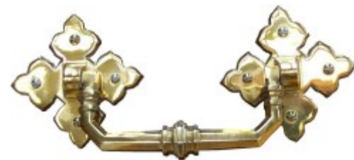
Set of Antique, Solid Brass Gothic Handles.£685:00