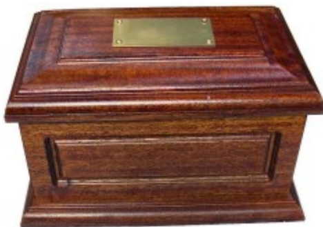
with Solid Mahogany Casket £215:00