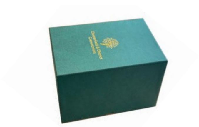
with Crematorium Box £60