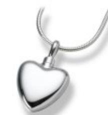
with Love Heart (no chain) £295:00

Our Prices Include for the Collection/Receiving of the Ashes, for taking responsibility for them and for storage on our premises for up to thirty days Subject to availability