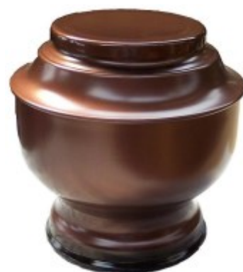
with Metal Spun Urn £175:00