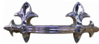
Set of Three Nickel Finished Fleur Handles.