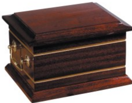
with Solid Wood “Lesbury” Urn £275:00

Our Prices Include for the Collection/Receiving of the Ashes, for taking responsibility for them and for storage on our premises for up to thirty days Subject to availability