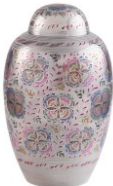
with “Grace” Urn £275:00