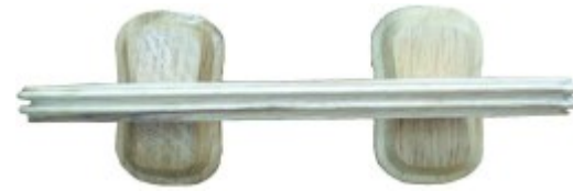
Set of Three Oak Bar Handles, and T-ends.£95:00