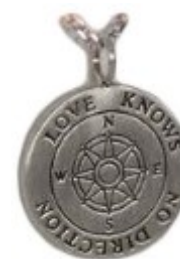
with Compass (with chain) £180:00