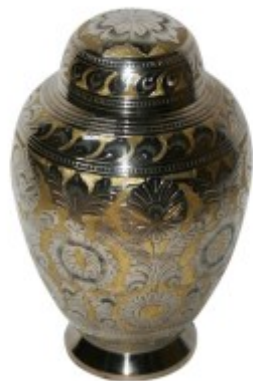
with Ambassador Urn £285:00