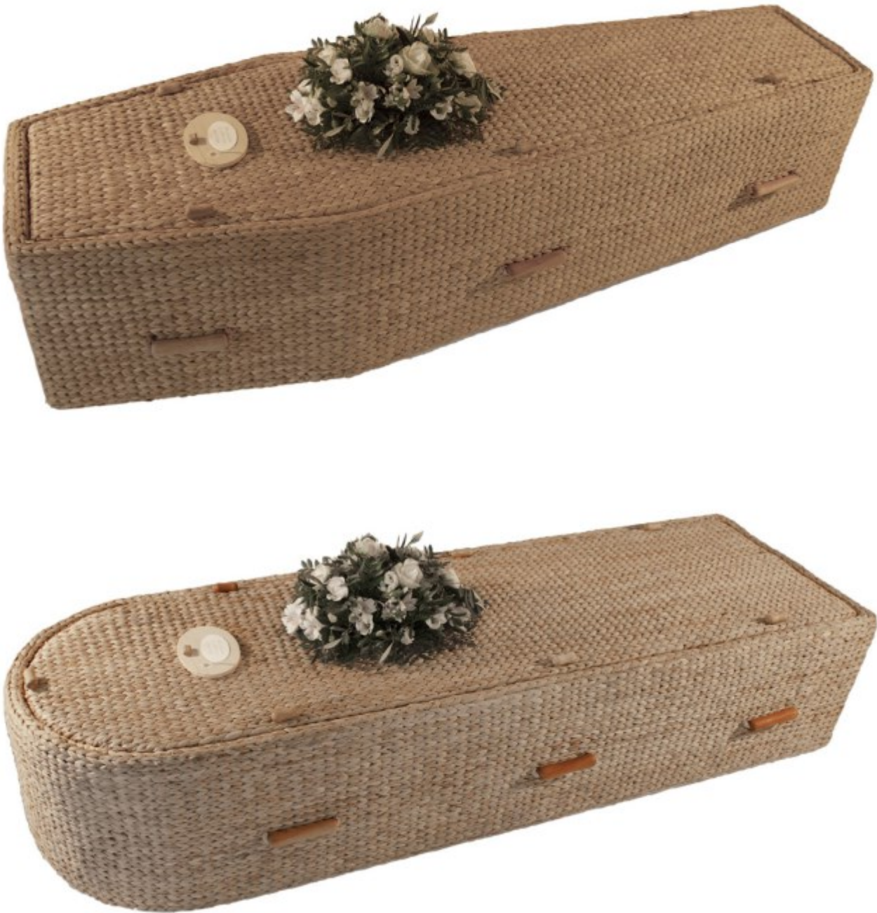
(Flowers not included)