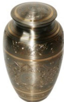
with “Sovereign” urn £270:00