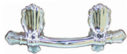
Set of Three Cast Metal Nickel Finished Doric Handles.