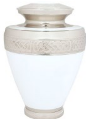
with Brass “Marble White” Urn £275:00