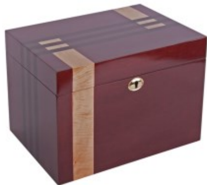
with Inlaid Wooden “Azure” Casket £255:00