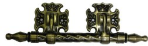
Set of Three Antique Brass Bar Handles, and T-ends £185:00