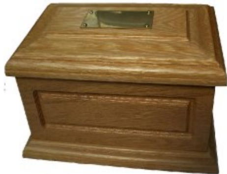
with Solid Oak Casket £215:00