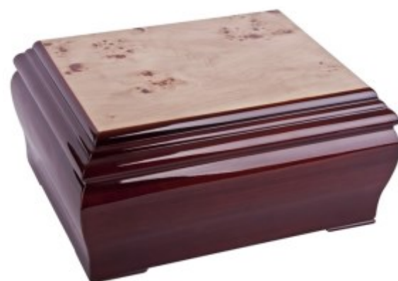
with Continental Casket £235:00