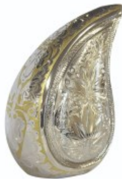
with Teardrop Patterned Urn £375:00 Inc. Keepsake - £455.00