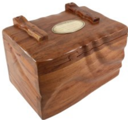
with Solid Wood “Trent” Urn £295:00